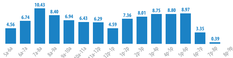
Represents weekday ridership from Nov. 1, 2017 to April 30, 2018.

PERFORMANCE: Route 1 performs poorly in terms of riders per revenue vehicle hour and is slightly below average in terms of riders per trip: