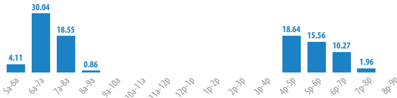
Represents weekday ridership from Nov. 1, 2017 to April 30, 2018.

PERFORMANCE: Given Route 36's limited service and relatively strong ridership, the productivity of the route is strong in terms of riders per trip: